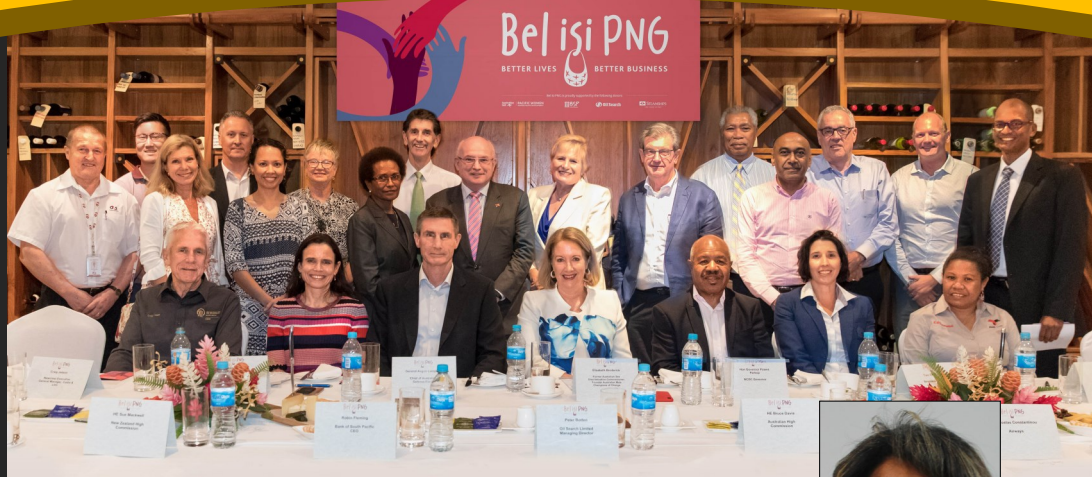
CEO's Forum Dinner—Bel Isi Launch, September, 2018